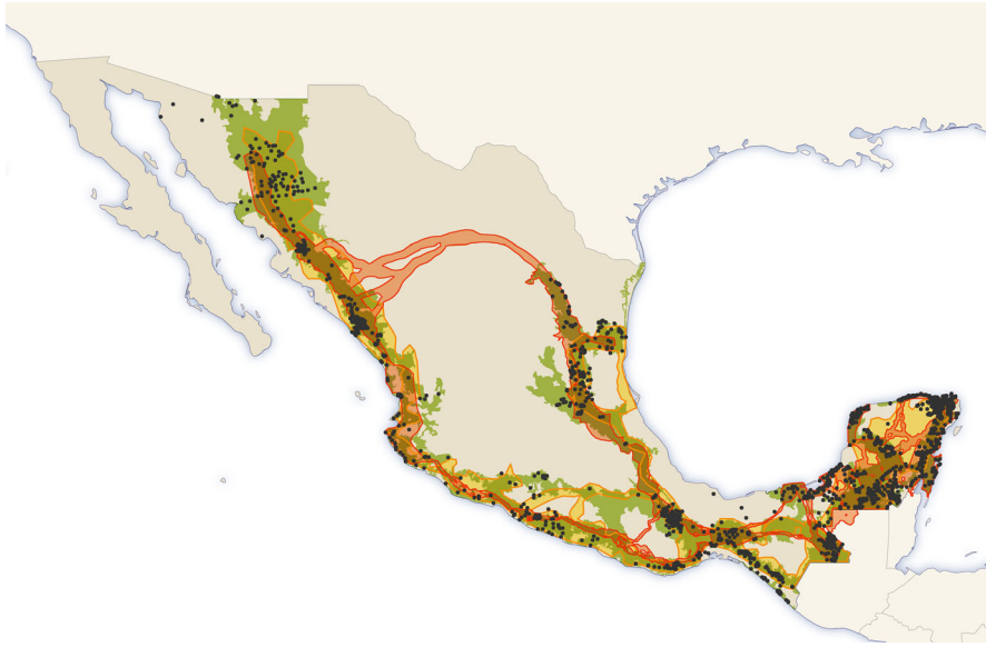
Fig. 1 Jaguar records (black dots) in Mexico in the last 25 years and three different jaguar published range maps identifying biological corridors. The green area represent the Jaguar Subpopulations defined by de la Torre et al. (2018), the yellow are the corridors defined by Rodriguez-Soto et al. (2013), and the orange range represent the jaguar corridors defined by

two decades, and local expert knowledge to identify what we call Jaguar Geographic Regions (JGRs) in Mexico. Those are well-defined large units with similar ecological characteristics across the jaguar distribution range. We then identify Jaguar Conservation Units (JCUs) in the JGRs using habitat suitability models. Finally, we identified the areas more likely to maintain the connectivity between the JCUs integrating our habitat suitability model with Least Cost Path and Circuit Theory analyses. With this approach, we modeled jaguar habitat and corridors and to develop a regional conservation planning tool for the species at country scale. An additional goal is that this information can be used by stakeholders such as the Mexican Federal Government, State's Governments, local and international Non-Governmental Organizations, international agencies, scientists, and local people to implement sustainable development policies to reduce habitat loss and fragmentation, and maintain the connectivity among JCUs.