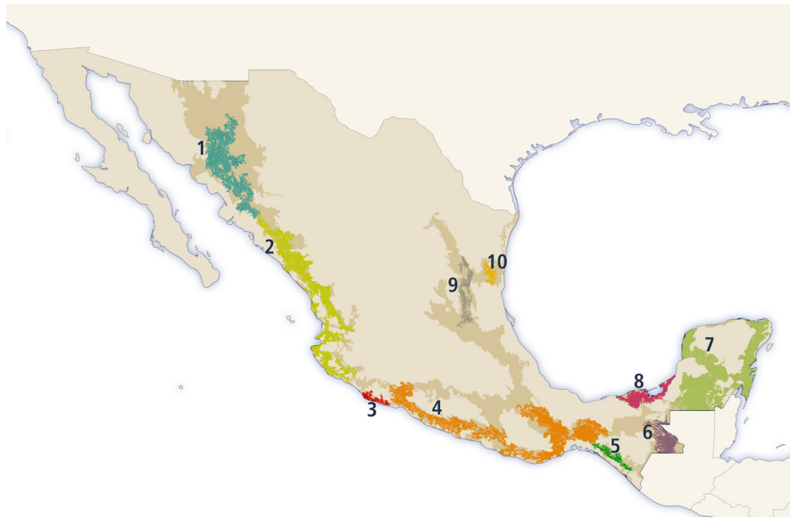
Fig. 3 Jaguar Conservation Units (JCUs) in Mexico. These polygons encompassed 241,676 km 2 and are distributed across the five JGRs. The 10 JCUs for conservation are the following ones: (1) Sierra Madre- North Pacific (31,910 km 2 ); (2) Sinaloa-Central Pacific (41,289 km 2 ); (3) Coast of Colima (2,379 km 2 );

(4) Sierra Madre-South Pacific (Guerrero Oaxaca; 59,643 km 2 ); (5) Sierra Madre de Chiapas (4,162 km 2 ); (6) Selva Lacandona (10,777 km 2 ); (7) Yucatan Peninsula (71,209 km 2 ); (8) Pantanos de Centla-Laguna de Términos (10,056 km 2 ); (9) Sierra Madre Oriental (7,504 km 2 ); (10) Sierra de Tamaulipas (2,747 km 2 ).