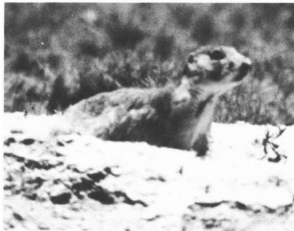
FIG. 1. Cynomys mexicanus.